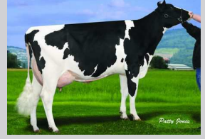
Alpina Dolman Swannie 2009