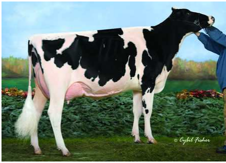
Vintage Dolman Millie - 2010