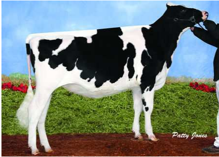
Vintage Dolman Milly - 2009